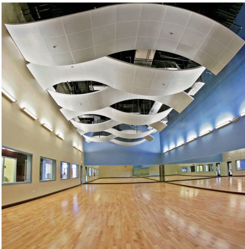
Promoting health and wellness, About Family Fitness Center in Coral Springs, Florida, features a curving metal ceiling system installed by Acousti Engineering Company of Florida. Designed by Synalovski, Gutierrez & Romanik, the project's aluminum ceiling system offers a modern aesthetic with the ability to control acoustics in noisy gymnasiums and exercise classrooms.

of this core acoustics document is the Facility Guidelines Institute (FGI). Founded in 1998 to provide continuity in the revision process of what were originally minimum construction standards from the Department of Health and Human Services (DHHS), FGI has produced the Guidelines for Design and Construction of Health Care Facilities —the 2010 edition is now used in some form by 42 states. 7